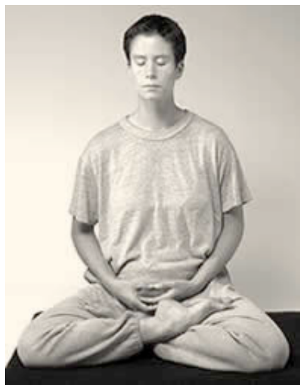
Full Lotus position

Another position is the half lotus , where the left foot is placed up onto the right thigh and the right leg is tucked under. This position is slightly asymmetrical and sometimes the upper body needs to compensate in order to keep itself absolutely straight.