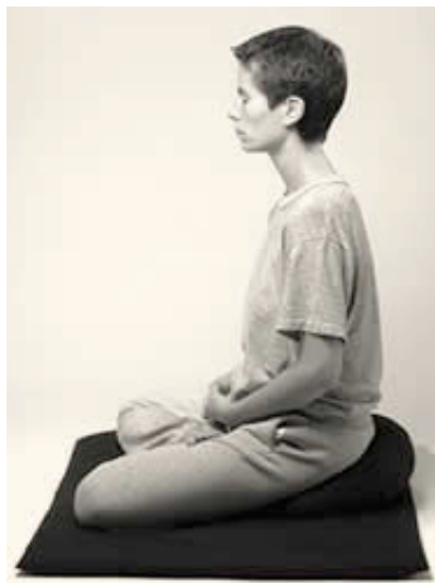
Half Lotus position

Another position is the half lotus , where the left foot is placed up onto the right thigh and the right leg is tucked under. This position is slightly asymmetrical and sometimes the upper body needs to compensate in order to keep itself absolutely straight.